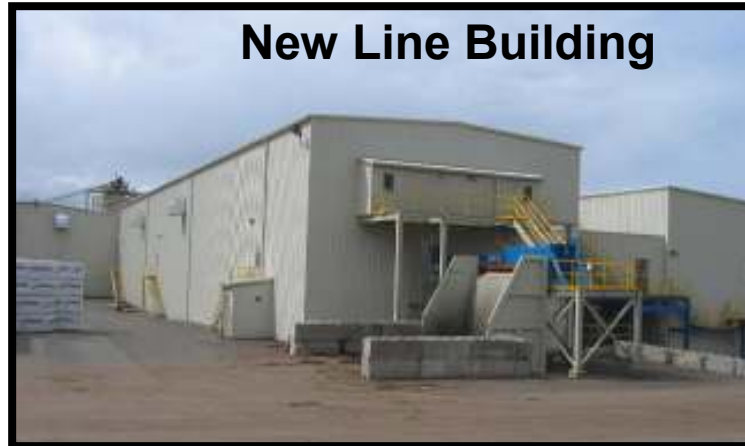
New Line Building